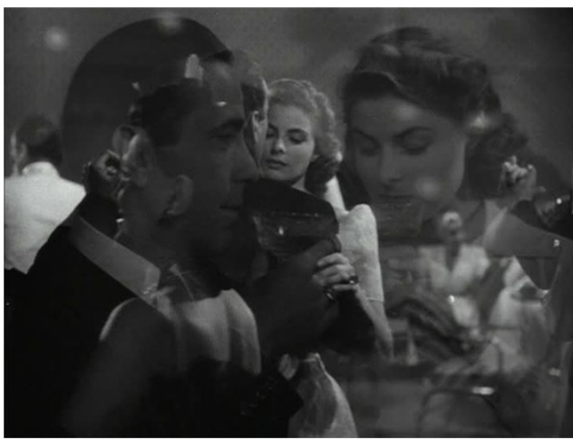
Ingrid Bergman as "Ilsa Lunda" in CASABLANCA

HOME ABOUT FEATURED ARTISTS EDITIONS MIXTAPES COLLABORATIONS RANDOM VIEW